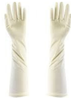
Product Code: LMS004

Protezione long cuff gloves are latex, powder-free surgical gloves that offer extra protection and comfort for medical professionals. These gloves are designed to fit snugly and smoothly on the hands, reducing finger fatigue and enhancing efficiency. They are ideal for obstetric and gynaecological procedures, as well as other deep cavity surgeries that require extended arm coverage.