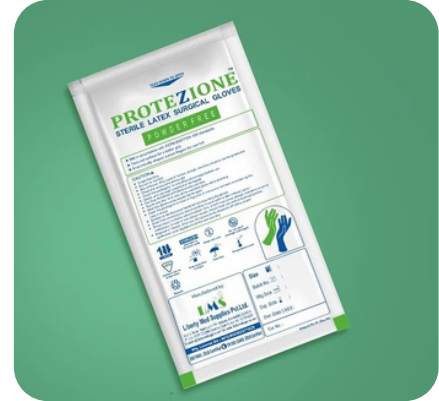
Product Code: LMS002

Protezione sterile latex surgical gloves powder free are medical gloves that are made from natural rubber latex and are free of any powder or additives. They are designed to provide a high level of protection and comfort for the wearer during surgical procedures. They are also resistant to tears, punctures, and chemicals.