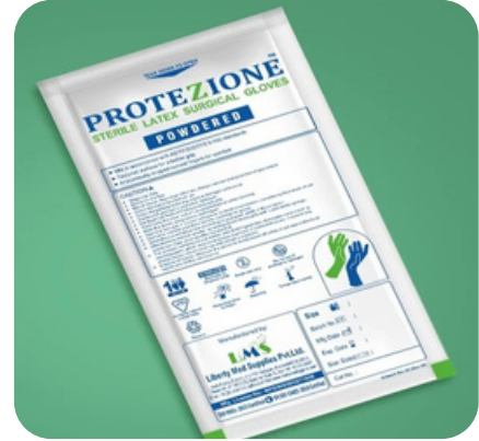
Product Code: LMS001

Protezione surgical gloves that are made of natural rubber latex and pre-powdered with bio-absorbable corn starch. These gloves are designed to provide a comfortable and secure fit for medical professionals who perform various surgical procedures.